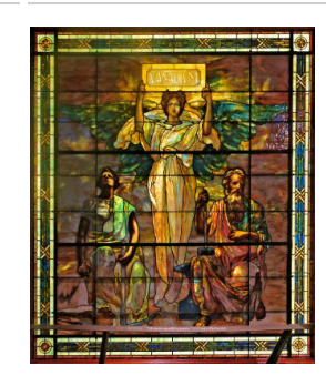
Title: Vanadium Window Date: c. 1912 Primary Maker: Rudy Brothers Company Medium: Opalescent glass; Lead