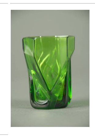
Title: Glass, Shot Date: 1928 Primary Maker: Consolidated Lamp & Glass