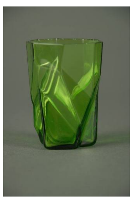
Title: Glass, Shot Date: 1928