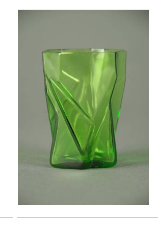
Title: Glass, Shot