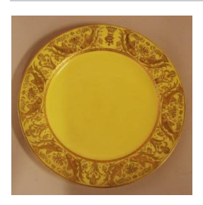
Title: Plate, Dinner Date: c. 1900 Primary Maker: Mintons Medium: ceramic, glaze, gold, porcelain