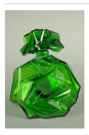
Title: Decanter Date: 1928