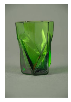
Title: Glass, Shot