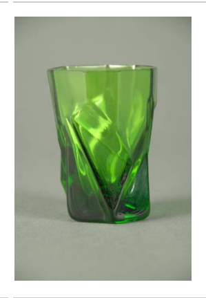
Title: Glass, Shot