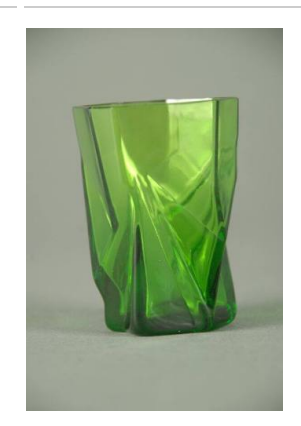
Title: Glass, Shot