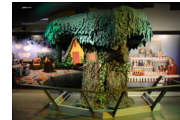
Title: Prop, Theatrical Date: 1968-2001 Medium: Wood; Metal; Fabric; Canvas(?); Linen(?); Paint; Plastic; Rubber