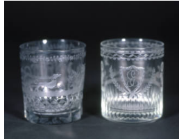
Title: Tumbler Date: c.1825 Primary Maker: Bakewell, Page & Bakewell Medium: Glass