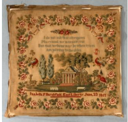
Title: Sampler Date: 1851 Primary Maker: Isabella Patterson Burchfield Medium: Wool; Canvas