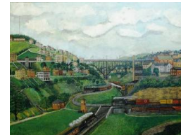
Title: Crossing the Junction Date: 1934 Primary Maker: John Kane Medium: Oil on canvas