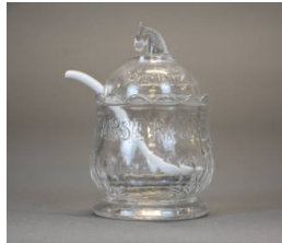
Title: Jar, Condiment Date: 1872-1875 Primary Maker: Heinz Noble and Company Medium: Glass; Porcelain