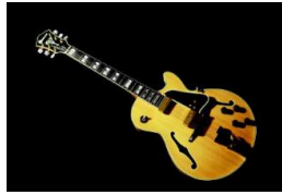
Title: Guitar Date: 1980-1989 Primary Maker: Ibanez Medium: Spruce; Maple; Metal; Ivory; Enamel; Abalone; Pearl; Ebony