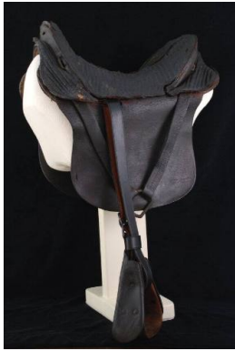
Title: Saddle Date: 1861 Primary Maker: Allegheny Arsenal Medium: Wood; Leather; Metal