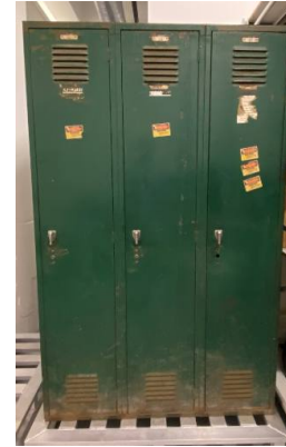
Title: Locker Medium: Metal, Paint, Stickers