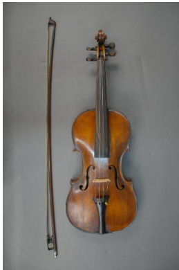
Title: Violin Date: 1850 Primary Maker: Frederick Augustus Glass Medium: Wood; mother-of-pearl; Paper; Metal