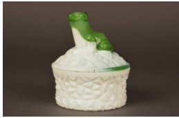
Title: Dish, Covered Date: 1887 Primary Maker: Atterbury & Company Medium: Glass