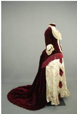
Title: Dress Date: c. 1880 Primary Maker: House of Worth Medium: silk, cotton, metal, wood