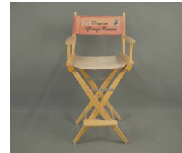
Title: Chair, Director's Date: c. 1994 Medium: Wood; Varnish; Metal; Canvas; Thread; Plastic