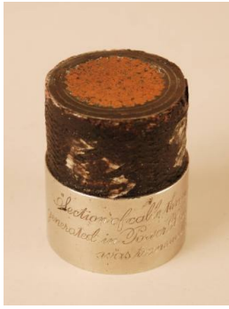
Title: Commemorative Date: 1895 Primary Maker: Westinghouse Electric and Manufacturing Company Medium: Metal, Rubber (?), Rubber impregnated fiber (?), Plastic