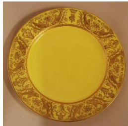
Title: Plate, Dinner Date: c. 1900 Primary Maker: Mintons Medium: ceramic, glaze, gold, porcelain