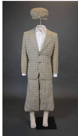
Title: Costume, Performance Date: 1952 Medium: Wool; Metal; Plastic