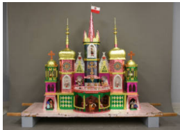
Title: Szopka Date: c. 1982 Primary Maker: Joseph A. Baranowski Medium: wood, metal, cardboard, plastic foam, metallic foils, molded plastics, paint