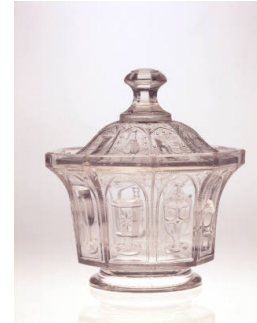
Title: Novelty, Promotional Date: c. 1855 Primary Maker: C. Ihmsen & Company Medium: Glass