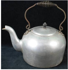
Title: Teakettle Date: c. 1932 Primary Maker: The Aluminum Cooking Utensil Company, Inc. Medium: Aluminum; Wood