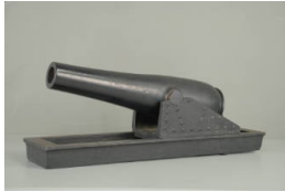
Title: Model Date: 1864 Primary Maker: Fort Pitt Foundry Medium: Iron; Metal; Wood; Paper; Adhesive