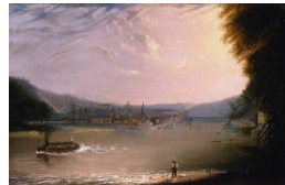
Title: Point of Pittsburgh Date: 1845 Primary Maker: William Coventry Wall Medium: Oil on canvas