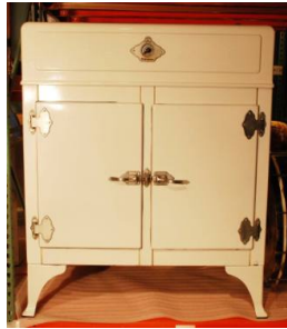
Title: Refrigerator Date: 1930 Primary Maker: Westinghouse Electric and Manufacturing Company Medium: Metal, Wood, Enamel