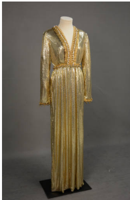
Title: Gown, Evening Date: 1969 Primary Maker: Oscar de La Renta Medium: aluminum fabric, cotton, beads, sequins, rhinestones