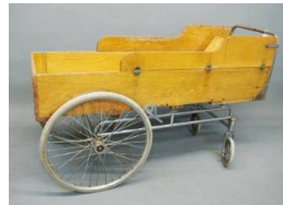
Title: Cart Date: 1910-1929 Primary Maker: The Colson Corporation Medium: Wood/Metal /Rubber