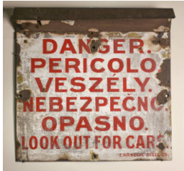
Title: Sign Primary Maker: Carnegie Steel Company Medium: Sheet steel; Enamel paint