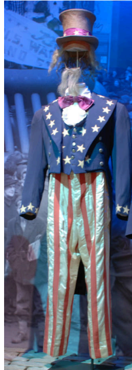
Title: Costume, Performance Date: c. 1940 Primary Maker: Brooks Costume Company Medium: Cotton; satin; various metals; elastic; horse hair; plastic